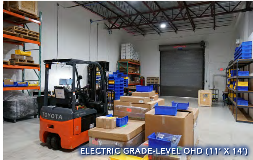
ELECTRIC GRADE-LEVEL OHD (11' X 14')