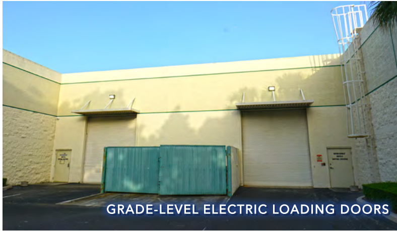
GRADE-LEVEL ELECTRIC LOADING DOORS