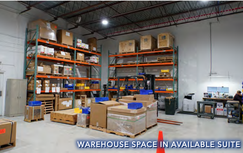
WAREHOUSE SPACE IN AVAILABLE SUITE