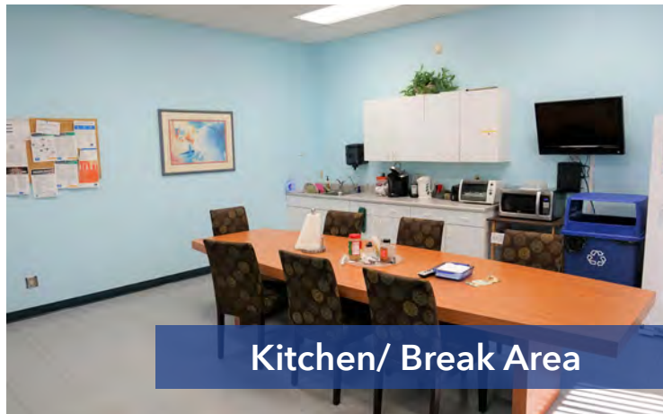
Kitchen/ Break Area