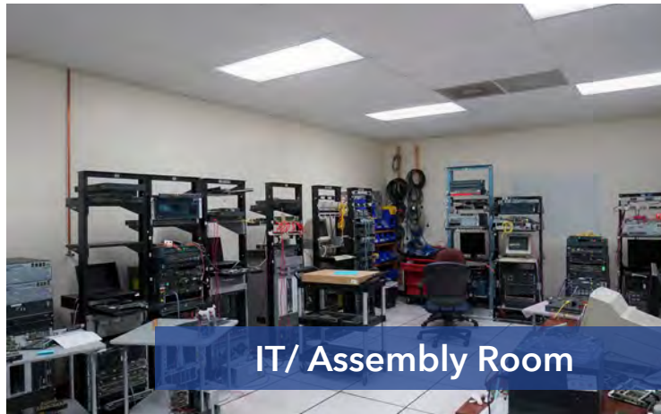
IT/ Assembly Room